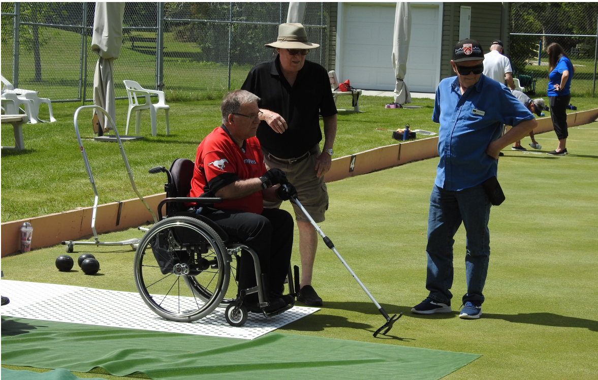
Wheelchair Bowler using the UBI Launcher