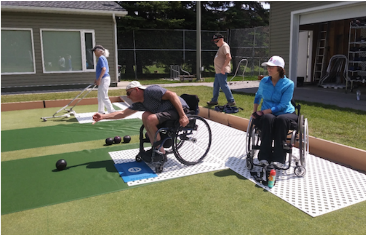
Wheelchair Bowler Delivering a Bowl