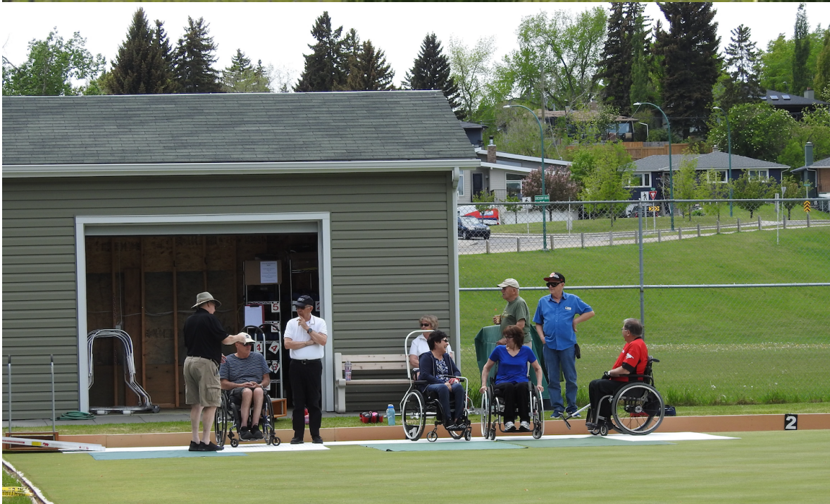
Group of Wheelchair Bowlers at Practice Session