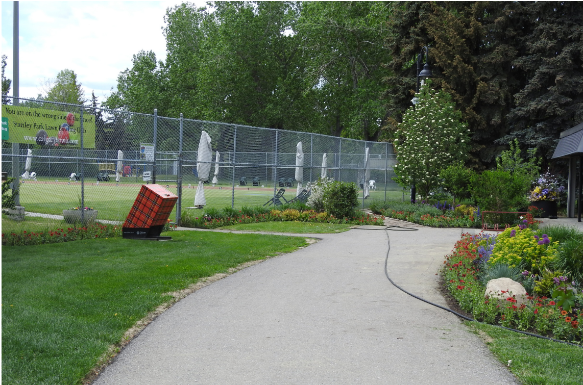
Short Distance from Parking Lot on Level Pavement