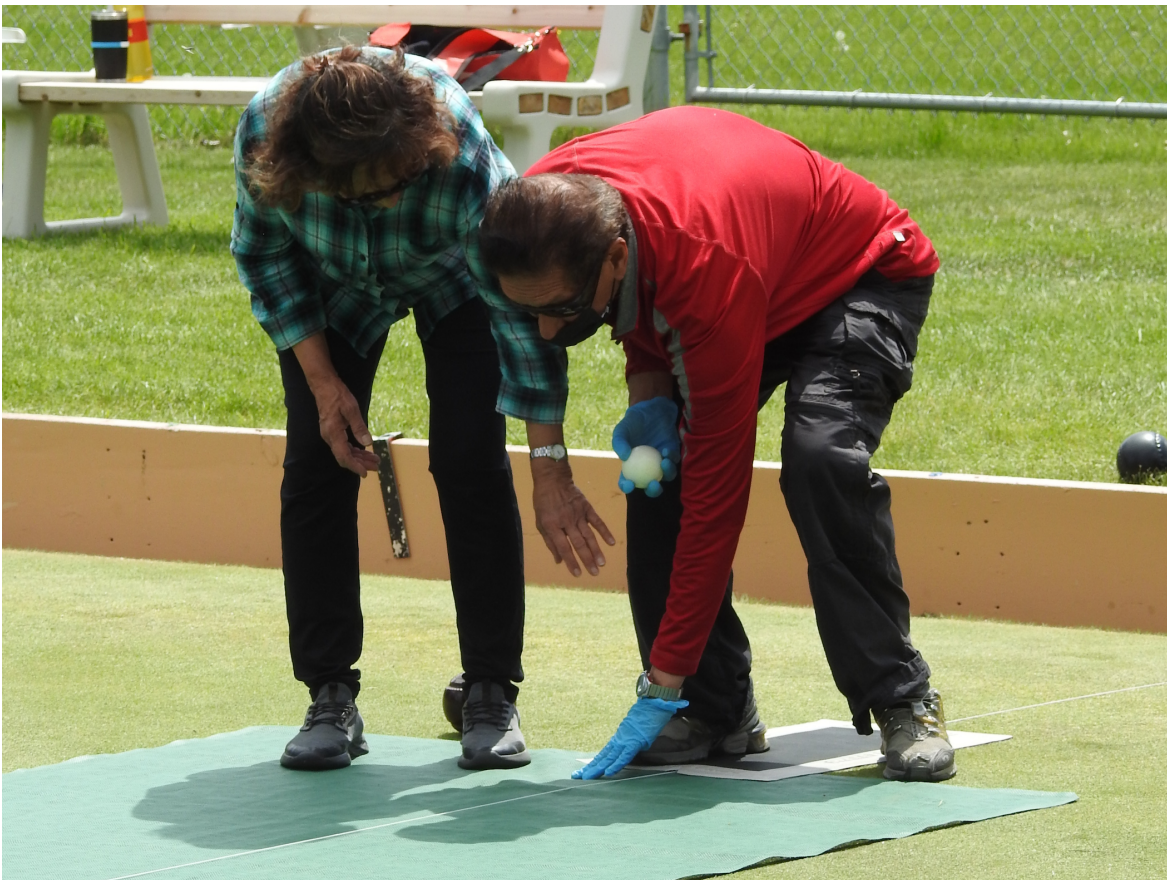
B1 Visually Impaired Bowler Touching Rink Centre String