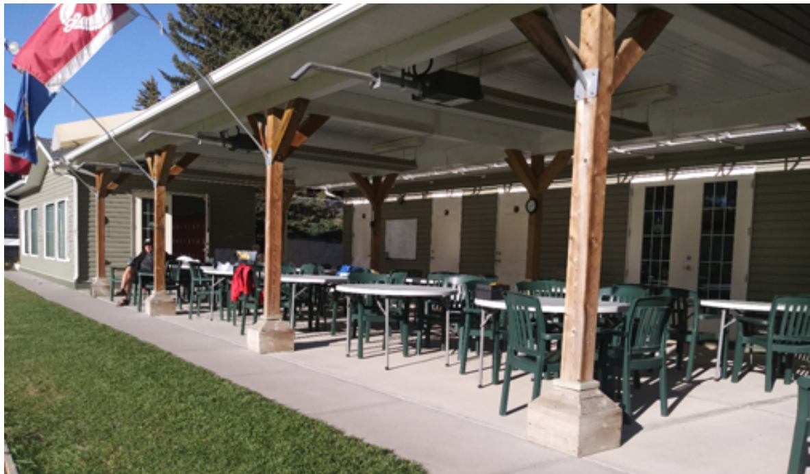
Overhead Heated Outdoor Patio