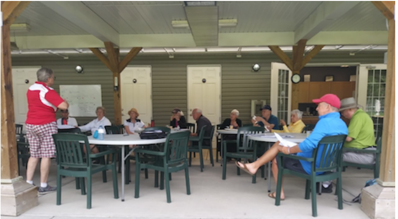
SPLBC Lunch & Learn - NCCP Coach and Director Training